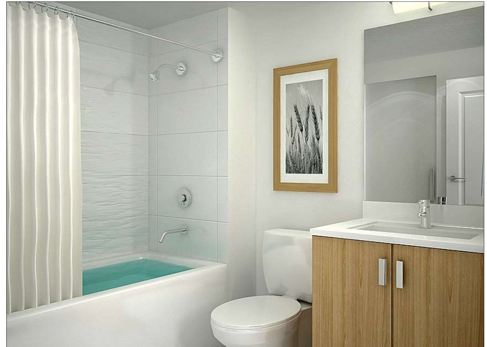
Homes at Ultra will be sleek and clean, with high-end, stylish finishings to complete the new condo dwellings and 11 townhomes.