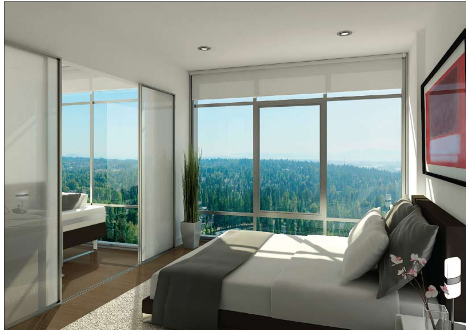
Homes at WestStone Properties' Ultra in Surrey's city centre range from studios to penthouses, with a wide variety in between (more photos on page 7).

Prices start at $169,900. Visit www.urbanvillageliving.com for more information.