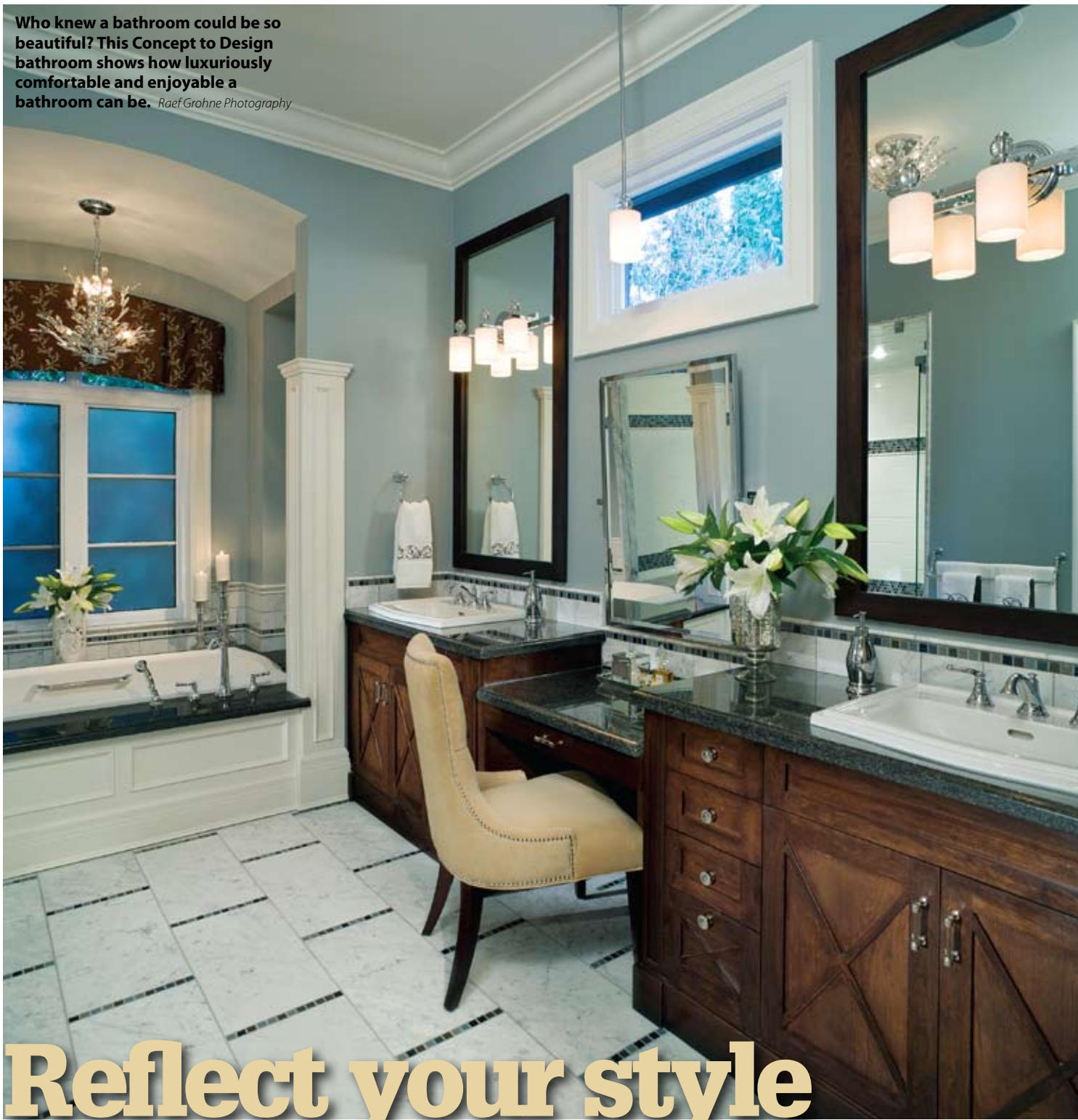
Who knew a bathroom could be so beautiful? This Concept to Design bathroom shows how luxuriously comfortable and enjoyable a bathroom can be.