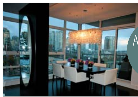
One key piece, such as a sparkling chandelier, can add a lot to one room.

"To us, the last finishing touches reflect the style of the homeowner and reflects the style and function of the space, and also, lets you do something that is a little more characteris-