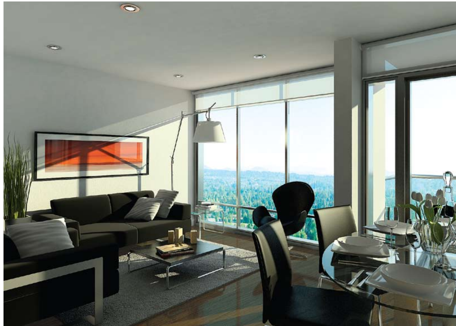
CONTINUED ON P.5 Homes at Ultra, which will be Surrey's largest residential tower in the city centre, will offer sweeping views of the Georgia Strait – and beyond.

Ultra sits in the ultimate location in the new, emerging Surrey City Centre, just steps from Central City, SkyTrain, Simon Fraser University and Surrey's new civic centre development. The revitalization of Surrey City Centre