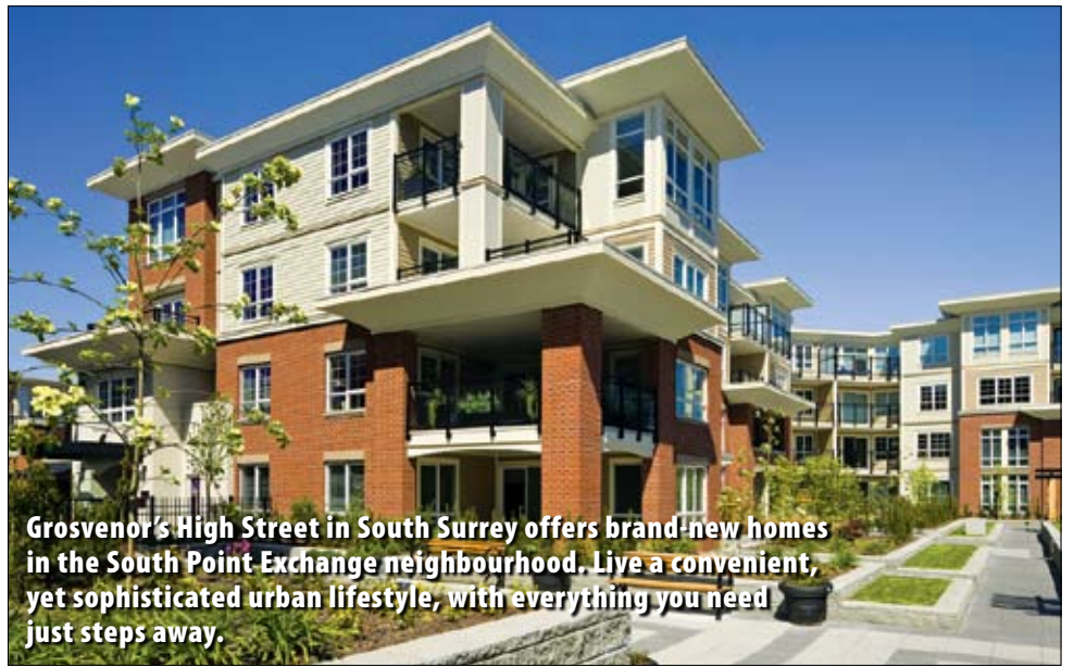
Grosvenor's High Street in South Surrey offers brand-new homes in the South Point Exchange neighbourhood. Live a convenient, yet sophisticated urban lifestyle, with everything you need just steps away.